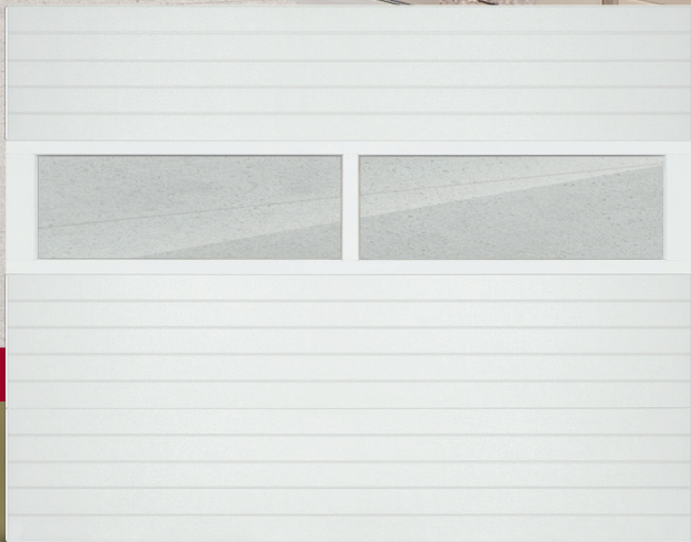
9' x 7' 3285 white with optional white aluminum full-view window section